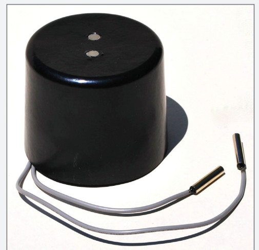
VX21-2 Road & Sub Surface Temperature Sensor shown.